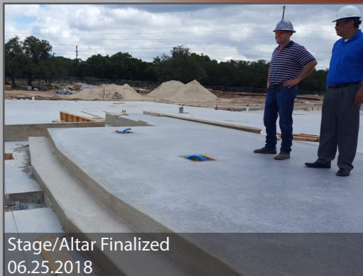
Stage/Altar Finalized 06.25.2018