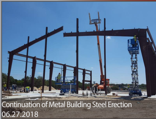
Continuation of Metal Building Steel Erection 06.27.2018