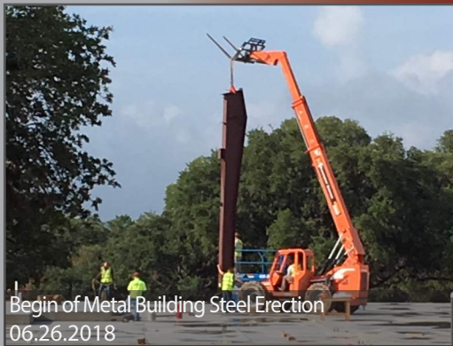
Begin of Metal Building Steel Erection 06.26.2018