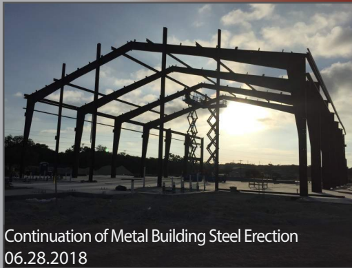
Continuation of Metal Building Steel Erection 06.28.2018

2017 Capital Campaign & Building Project