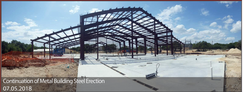
Continuation of Metal Building Steel Erection 07.05.2018