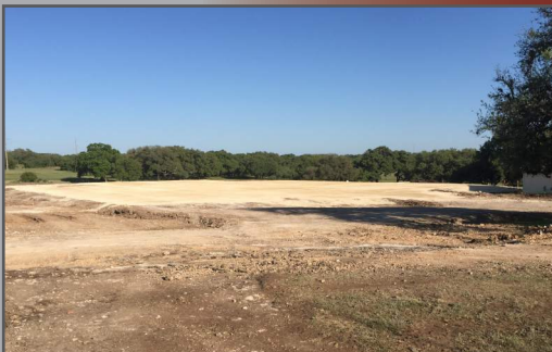
Building Pad Finalized 04.15.2018