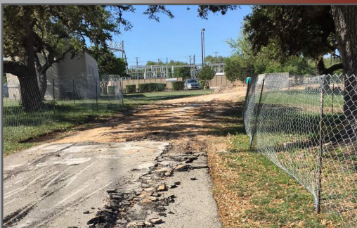
Road between parking zones razed 04.11.2018