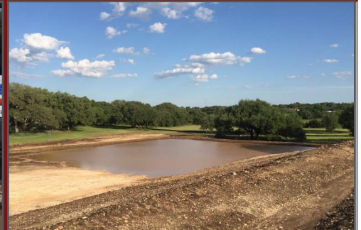
Removal & Stockpiling of Topsoil at Future Detention Pond _ 05.05.2018