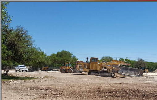
Trenching Equipment Delivered to Site 04.21.2018