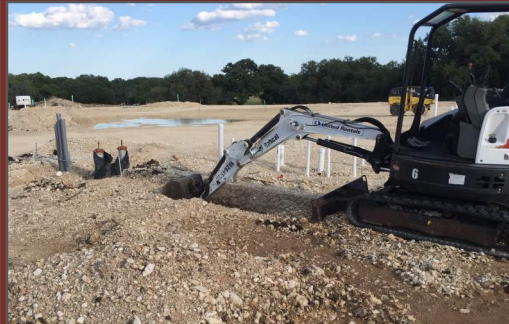
Trench for Building Utilities 05.05.2018