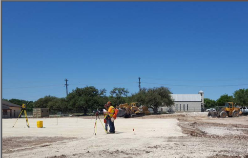
Establishing building corners 04.24.2018

2017 Capital Campaign & Building Project