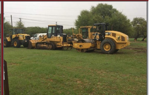
Sitework equipment Delivered 03.28.2018