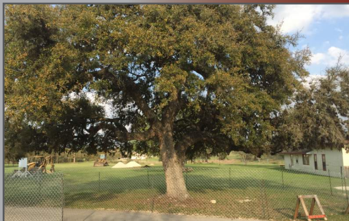
Tree protection Installed 03.17.2018