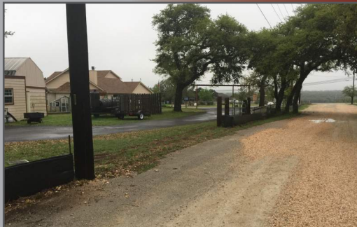
Silt Fence Installation 03.28.2018

2017 Capital Campaign & Building Project