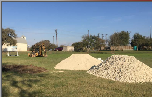
Temporary Driveway material & equipment delivery 03.15.2018