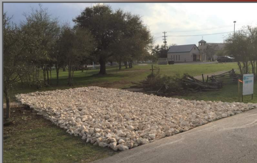
Construction Entrance Installed 03.17.2018