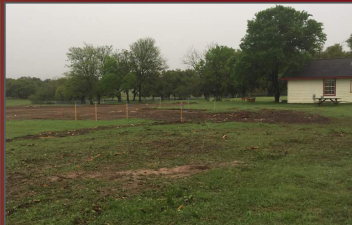
Removal & Stockpiling of Topsoil 03.28.2018