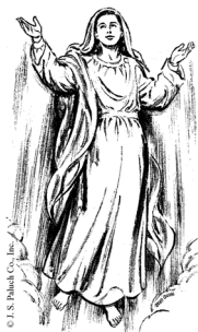
Assumption of the Blessed Virgin Mary